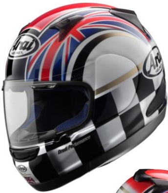
Flag Series "UK"