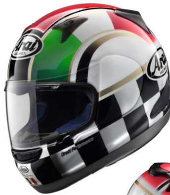
Flag Series "ITALY"