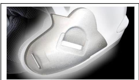
New cheek pad design is more similar to the full face style; with a full coverage EPS base & removable covers.