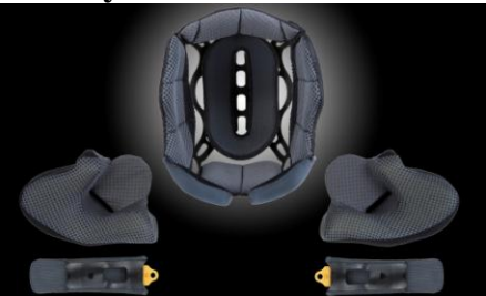
Fully removable Dry-Cool® liner in XC-RAM.