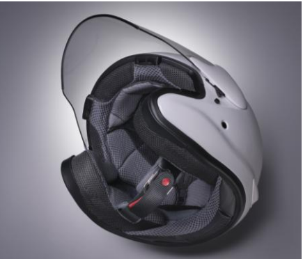
From the moment you slip into the XC or XC-RAM you will immediately recognize the Arai commitment to making a better helmet.