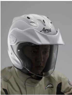
CT-Z (Diamond White)

Improving on the revolutionary XC-RAM, the new CT-Z® enhances the riding experience by offering the benefit of a peak/shield combination.