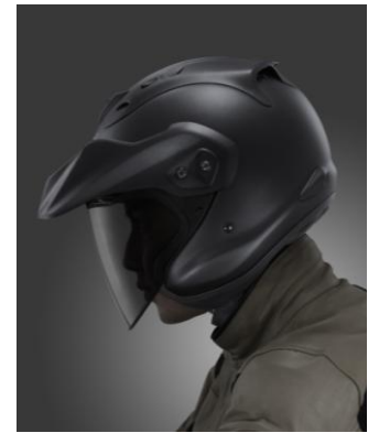
CT-Z (Black Frost)

The main focus of the new CT-Z was to provide a peak that works with the shield for riders who ride into the sun for extended periods of time.