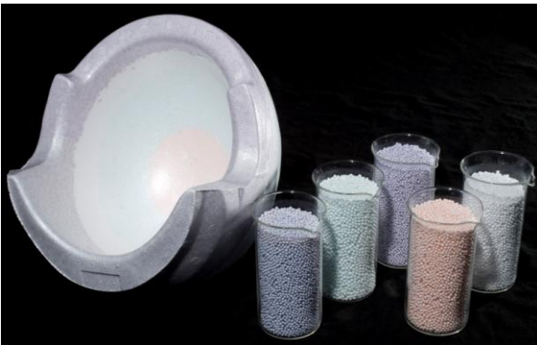
*Sample liner for visual reference only.

The absence of exaggerated edges or protrusions on the shell is not a lack of creativity, but a commitment to maintaining the integrity of the shell with real world impact performance in mind, the kind a rider might encounter on the unpredictable streets where impacts are anything but controlled or predictable.